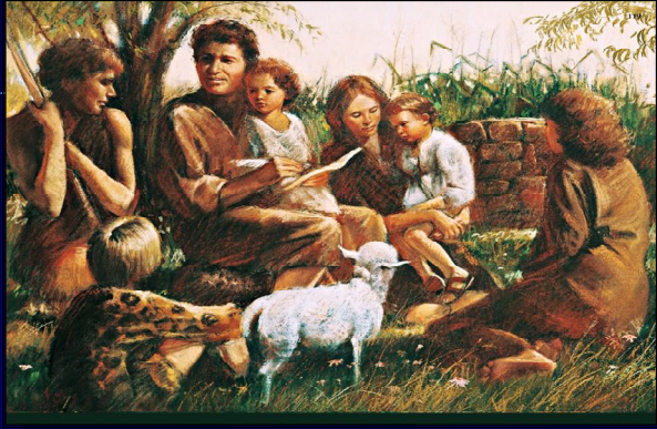
Adam & Eve teaching their Children