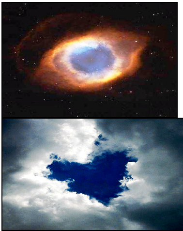
The EYE OF GOD